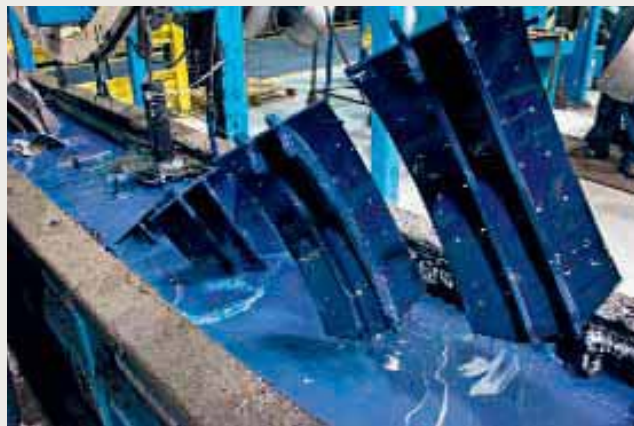
A special paint with rust inhibitor assures uniform coverage and corrosion resistance.